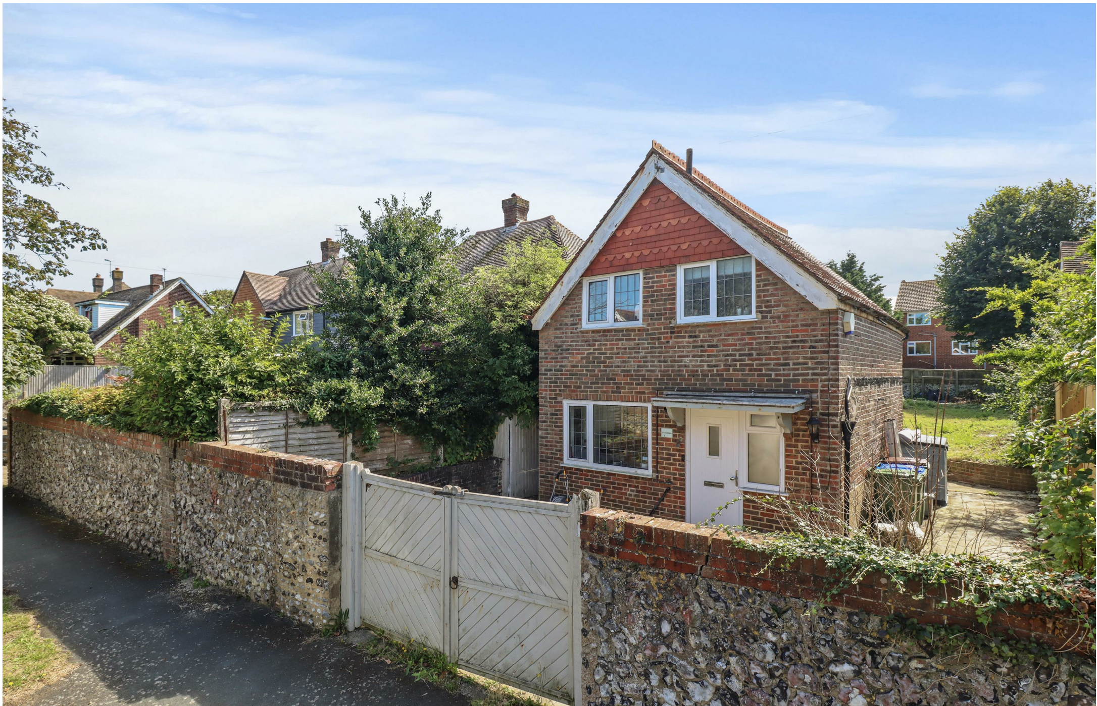
THE COTTAGE GROVE ROAD, SEAFORD, BN25 1TP